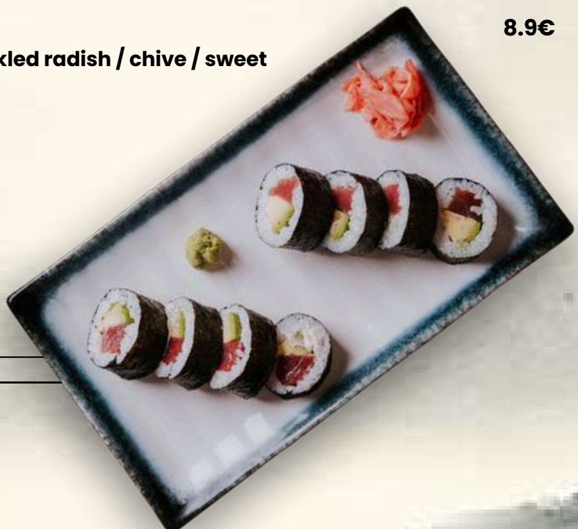
TUNA / AVOCADO / TRUFFLE

avocado / cucumber / pickled radish / chive / sweet chilli sauce / microherbs