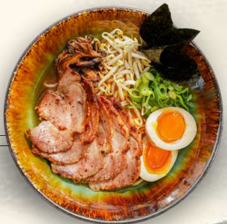
RAMEN WITH ROASTED PORK