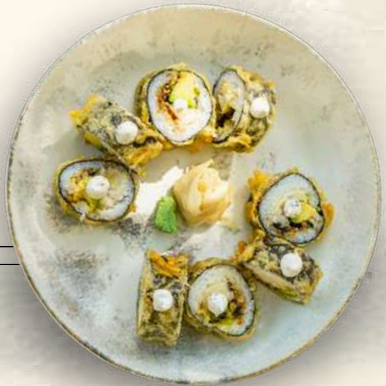
TEMPURA ROLL / BUTTER FISH

* gluten free tempura on customers command only