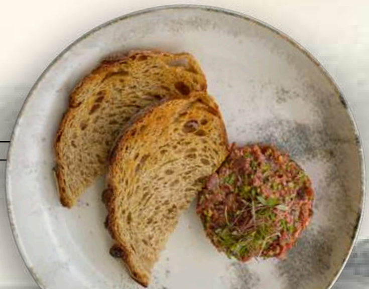
TUNA TARTAR TOGARASHI

KIMCHI 110g 4.2€ homemade, fermented and spicy salad, made out of chinese cabbage