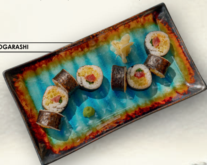
FUTOMAKI / TUNA / TOGARASHI

avocado / cucumber / pickled radish / chive / sweet chilli sauce / microherbs