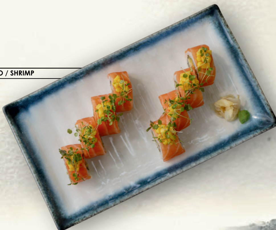
SALMON / MANGO / SHRIMP

OUT : bluefin tuna sashimi, chili caramelized onion 1, 3, 4, 6, 10