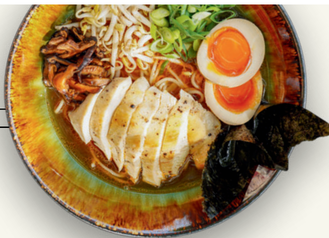
RAMEN WITH CHICKEN BREST