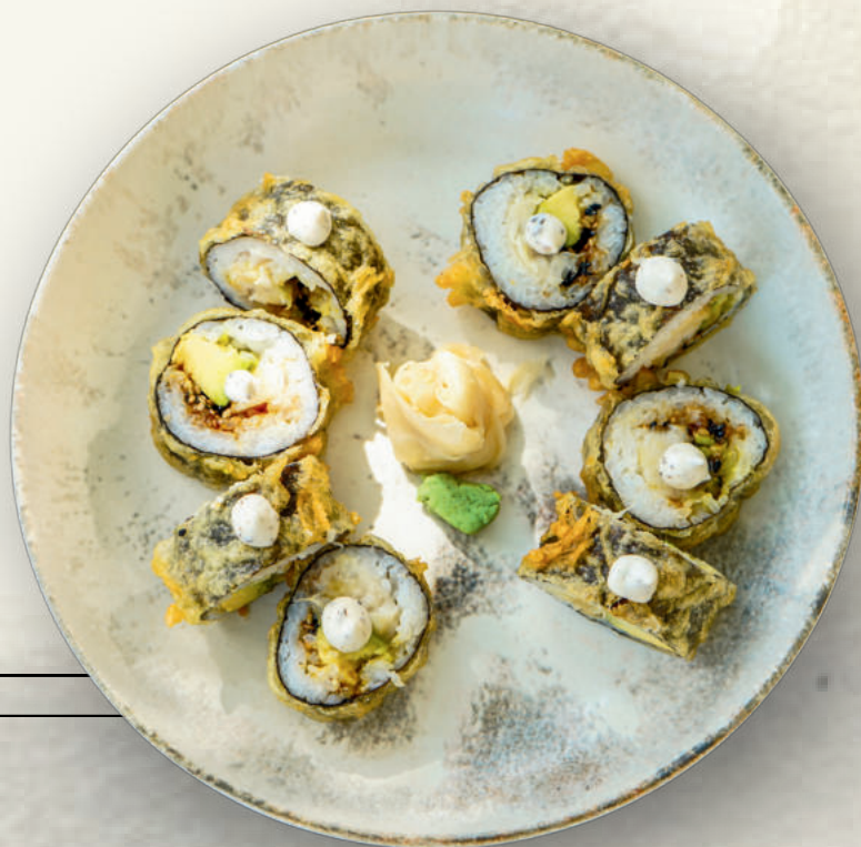
TEMPURA ROLL / BUTTER FISH

avocado / pickled radish / sugar peas / kimchi salad / japanese mayonnaise 1, 3